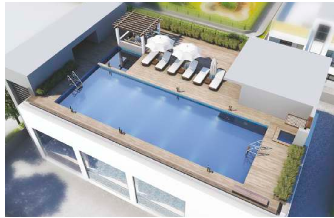
ROOF-TOP SWIMMING POOL ▲